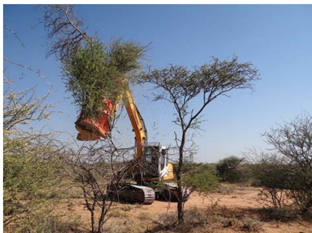
© Harvesting site of Organic Energy Solutions (Pty) Ltd (Ohlthaver & List

Economic assessments were conducted to quantify and value various key ecosystem services and land use options that are threatened by bush encroachment, but could potentially generate benefits to Namibia's welfare. Moreover, options for the use of harvested encroacher biomass were identified and economic profits estimated.